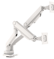
i5 Industries Array Duo Monitor Arm Side 2 – White – ARRDU-2