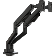
i5 Industries Array Duo Monitor Arm Side – Black – ARRDU-2