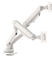
i5 Industries Array Duo Monitor Arm Side 2 – White – ARRDU-2