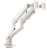
i5 Industries Array Duo Monitor Arm Side – White – ARRDU-2