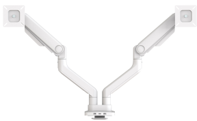
i5 Industries Array Duo Monitor Arm – White – ARRDU-2