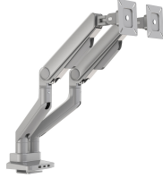
i5 Industries Array Duo Monitor Arm Side – Silver – ARRDU-2