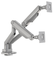
i5 Industries Array Duo Monitor Arm Side 2 – Silver – ARRDU-2