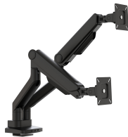
i5 Industries Array Duo Monitor Arm Side 2 – Black – ARRDU-2