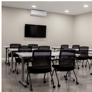
Conenct at i5 Office Configuration 3