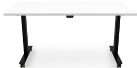
Connect Training Table Matte White Top Black Base Front