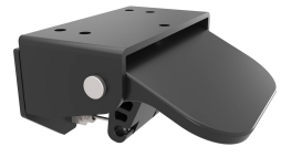
Connect Training Table Base