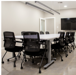
Conenct at i5 Office Configuration 1