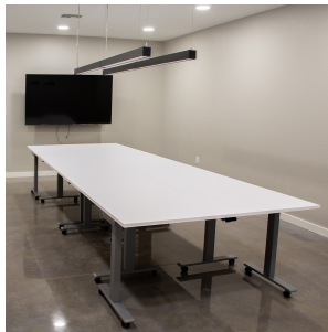
Conenct at i5 Office Configuration 2