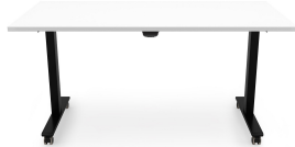
Connect Training Table Matte White Top Black Base Front