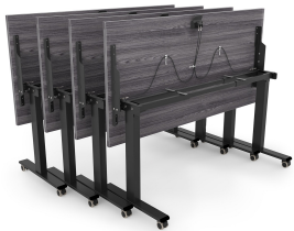
Connect Training Table Samoa Gray Top Black Base Stack