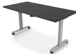
Connect Training Table Espresso Top Silver Base Side 2