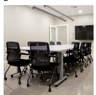
Conenct at i5 Office Configuration 1

Mahogany Top Silver Base Side Only Black Base - Paddle 2