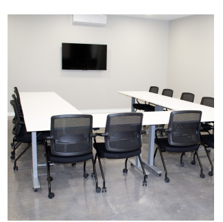
Conenct at i5 Office Configuration 5