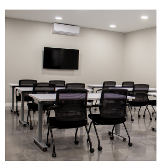
Conenct at i5 Office Configuration 3

Connect Training Table Samoa Gray Top White Base Stack