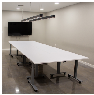
Conenct at i5 Office Configuration 2

Connect Training Table Walnut Connect Training Table Top Black Base Front