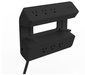
Clamp On Power Module with Example 3 - Black - PCL102, PCL102-PL