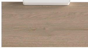
Clamp On Power Module with Example 2 - White - PCL102, PCL102-PL