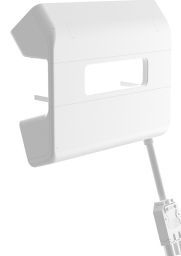
Clamp On Power Module with PWR Link 3 - White - PCL102-PL