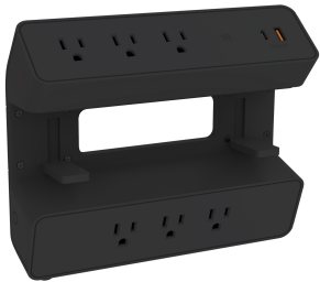
Clamp On Power Module with Example 4 - Black - PCL102, PCL102-PL