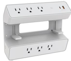
Clamp On Power Module with Example 4 - White - PCL102, PCL102-PL