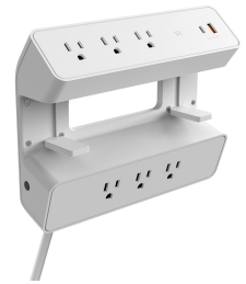
Clamp On Power Module with Example 3 - White - PCL102, PCL102-PL