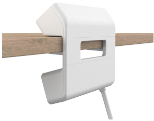
Clamp On Power Module with Example 1 - White - PCL102, PCL102-PL