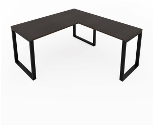
Fusion Metal Leg L Desk Espresso Top Black Base