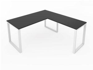
Fusion Metal Leg L Desk Black Top White Base Front