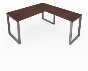
Fusion Metal Leg L Desk Mahogany Top Silver Base