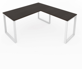
Fusion Metal Leg L Desk Espresso Top White Base