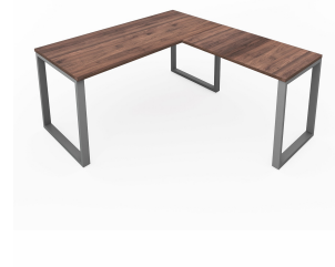
Fusion Metal Leg L Desk Walnut Top Silver Base