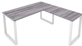
Fusion Metal Leg L Desk Samoa Gray Top White Base