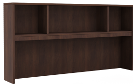
Kai Walnut Open Hutch