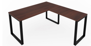
Fusion Metal Leg L Desk Mahogany Top Black Base