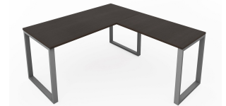
Fusion Metal Leg L Desk Espresso Top Silver Base