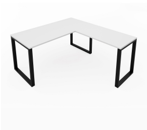
Fusion Metal Leg L Desk Matte White Top Black Base