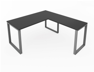
Fusion Metal Leg L Desk Black Top Silver Base Front