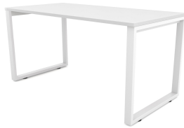
Fusion Metal Leg Desk Matte White Top White Base Side 2