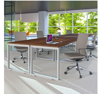
Fusion Office Scene Walnut Top Silver Base