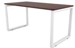
Fusion Metal Leg Desk Mahogany Top White Base Side 2