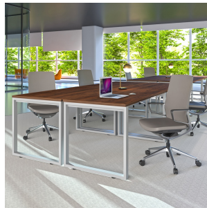
Fusion Office Scene Walnut Top Silver Base