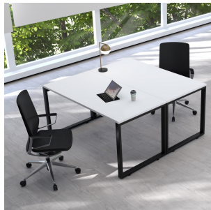
Fusion Office Scene Matte White Top Black Base