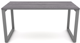
Fusion Metal Leg Desk Samoa Gray Top Silver Base Front