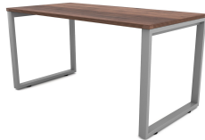
Fusion Metal Leg Desk Walnut Top Silver Base Side 2