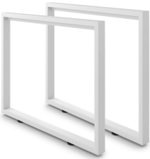
Fusion Metal Straight Leg Only White Base (PAIR)