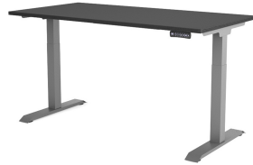
iRize Standing Desk Black Top Black Silver Base Side