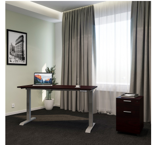
iRize Standing Desk Mahogany Top Silver Base Room Scene