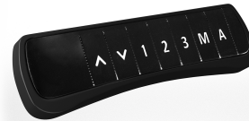
iRize Seven Button Remote