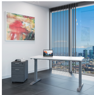
iRize Standing Desk Samoa Gray Top White Base Room Scene