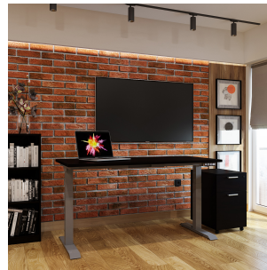
iRize Standing Desk Espresso Top Silver Base Room Scene