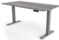
i5 Industries iRize Standing Desk Side – Samoa Gray Silver Base