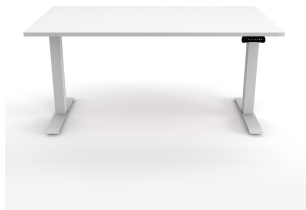
iRize Standing Desk Matte White Top White Base Front