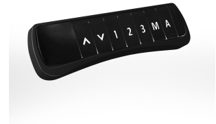
i5 Industries iRize Seven Button Remote