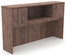
i5 Industries Kai Hutch with 2 Wood Doors – Walnut – OH66P-L2, OH71P-L2