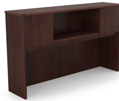
i5 Industries Kai Hutch with 2 Wood Doors – Mahogany – OH66P-L2, OH71P-L2