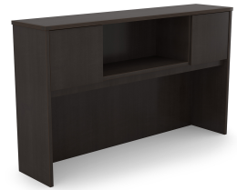
i5 Industries Kai Hutch with 2 Wood Doors – Espresso – OH66P-L2, OH71P-L2