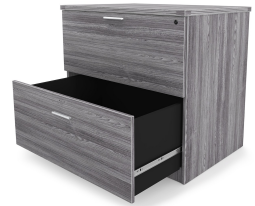
Kai Line 30 Lateral File Samoa Gray Open