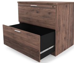
Kai Line 30 Lateral File Walnut Open