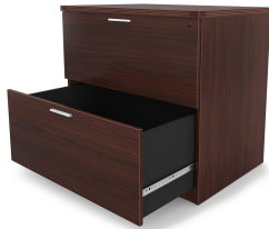
Kai Line 30 Lateral File Mahogany Open