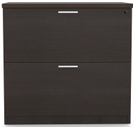
Kai Line 30 Lateral File Espresso Front