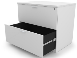
Kai Line 36 Lateral File Matte White Open