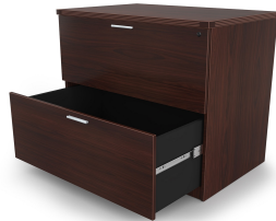
Kai Line 36 Lateral File Mahogany Open