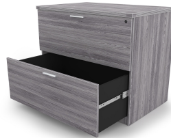
Kai Line 36 Lateral File Samoa Gray Open