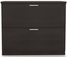
Kai Line 36 Lateral File Espresso Front