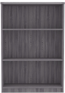
Kai Line 48 Bookcase 3 Shelf Samoa Gray Front