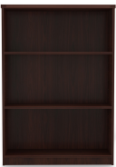
Kai Line 48 Bookcase 3 Shelf Mahogany Front