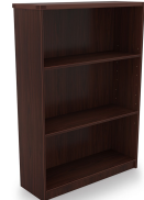
Kai Line 48 Bookcase 3 Shelf Mahogany Side