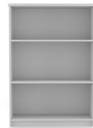
Kai Line 48 Bookcase 3 Shelf Matte White Front