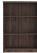
Kai Line 48 Bookcase 3 Shelf Walnut Front