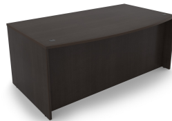
Kai Line Bow Front Desk Shell Espresso Back