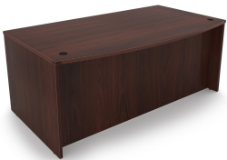
Kai Line Bow Front Desk Shell Mahogany Back