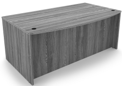
Kai Line Bow Front Desk Shell Samoa Gray Back