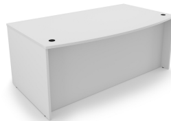
Kai Line Bow Front Desk Shell Matte White Back