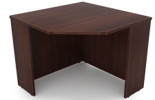
i5 Industries Kai Corner Shell – Mahogany – CR36