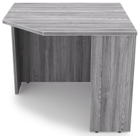
i5 Industries Kai Corner Shell Side – Samoa Gray – CR36