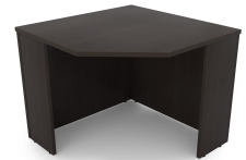
i5 Industries Kai Corner Shell – Espresso – CR36