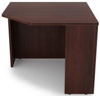
i5 Industries Kai Corner Shell Side – Mahogany – CR36