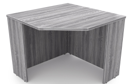
Kai Line Corner Desk Shell Samoa Gray Side