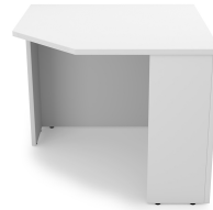
i5 Industries Kai Corner Shell Side – Matte White – CR36