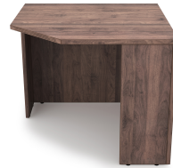
i5 Industries Kai Corner Shell Side – Walnut – CR36