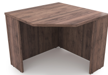
i5 Industries Kai Corner Shell – Walnut – CR36