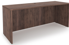
i5 Industries Kai Credenza Shell – Walnut – C2471, C2466