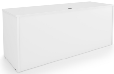
i5 Industries Kai Credenza Shell Front – Matte White – C2471, C2466