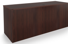
i5 Industries Kai Credenza Shell Front – Mahogany – C2471, C2466