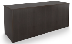
i5 Industries Kai Credenza Shell Front – Espresso – C2471, C2466