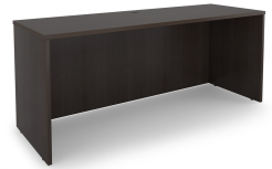
i5 Industries Kai Credenza Shell Front – Samoa Gray – C2471, C2466 i5 Industries Kai Credenza Shell – Matte White – C2471, C2466 i5 Industries Kai Credenza Shell Front – Matte White – C2471, C2466 i5 Industries Kai Credenza Shell – Espresso – C2471, C2466