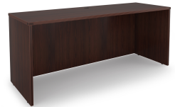
i5 Industries Kai Credenza Shell Front – Espresso – C2471, C2466 i5 Industries Kai Credenza Shell – Walnut – C2471, C2466 i5 Industries Kai Credenza Shell Front – Walnut – C2471, C2466 i5 Industries Kai Credenza Shell – Mahogany – C2471, C2466