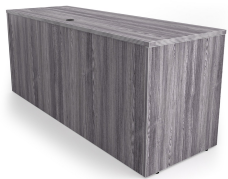
Kai Line Credenza Shell Samoa Gray Back