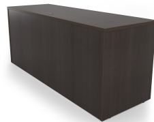
Kai Line Credenza Shell Espresso Back