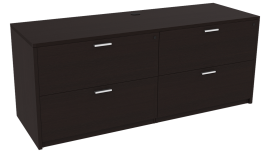
Espresso Credenza with Double Lateral Files