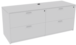
Matte White Credenza with Double Lateral Files