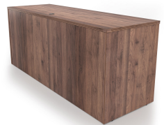
Kai Line Credenza Shell Walnut Back