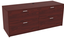
Mahogany Credenza with Double Lateral Files