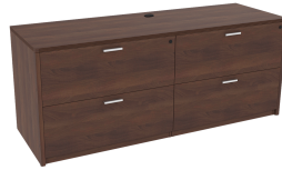
Walnut Credenza with Double Lateral Files