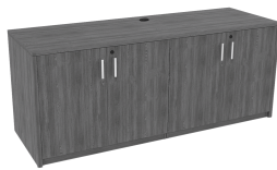
Samoa Gray Credenza Double Storage Cabinets