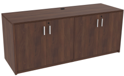
Walnut Credenza with Double Storage Cabinets