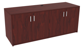
Mahogany Credenza with Double Storage Cabinets