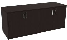
Espresso Credenza with Double Storage Cabinets