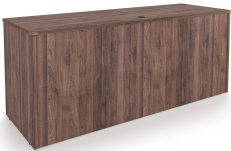
i5 Industries Kai Credenza Front – Walnut – C2471, C2466