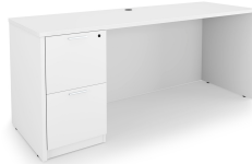
i5 Industries Kai Credenza File Pedestal – Matte White – C2471P-7, C2466P-4