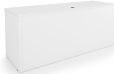
i5 Industries Kai Credenza Front – Matte White – C2471, C2466