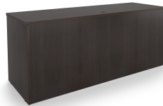
i5 Industries Kai Credenza Front – Espresso – C2471, C2466