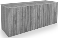
i5 Industries Kai Credenza Front – Samoa Gray – C2471, C2466