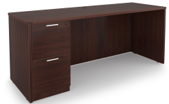
i5 Industries Kai Credenza File Pedestal – Mahogany – C2471P-7, C2466P-4