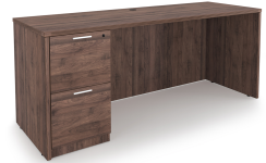
i5 Industries Kai Credenza File Pedestal – Walnut – C2471P-7, C2466P-4