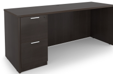
i5 Industries Kai Credenza File Pedestal – Espresso – C2471P-7, C2466P-4