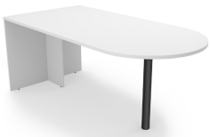
i5 Industries Kai D-Top Desk Shell – Matte White – DT3671