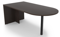
i5 Industries Kai D-Top Desk Shell – Espresso – DT3671