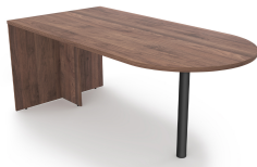
i5 Industries Kai D-Top Desk Shell – Walnut – DT3671