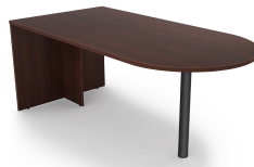
i5 Industries Kai D-Top Desk Shell – Mahogany – DT3671