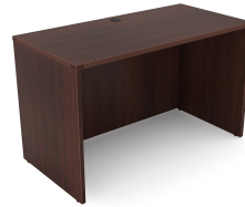
i5 Industries Kai Rectangular Desk Shell – Mahogany – D2448