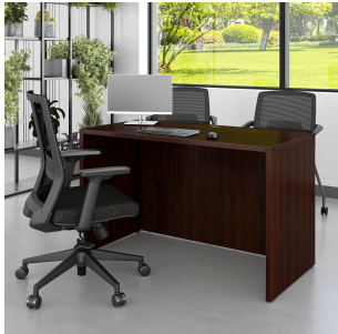
i5 Industries Close Up View of D2448 in a client space