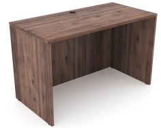
i5 Industries Kai Rectangular Desk Shell – Walnut – D2448