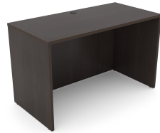
i5 Industries Kai Rectangular Desk Shell – Espresso – D2448