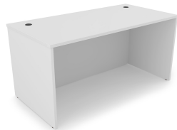
i5 Industries Kai Rectangular Desk Shell – Matte White – D3048, D3060, D3066, D3071, D3671