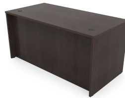
i5 Industries Kai Rectangular Desk Shell Front – Espresso – D3048, D3060, D3066, D3071, D3671