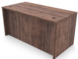
i5 Industries Kai Rectangular Desk Shell Front – Walnut – D3048, D3060, D3066, D3071, D3671