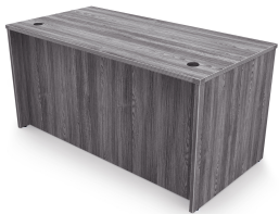
i5 Industries Kai Rectangular Desk Shell Front – Samoa Gray – D3048, D3060, D3066, D3071, D3671