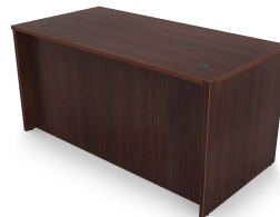
i5 Industries Kai Rectangular Desk Shell Front – Mahogany – D3048, D3060, D3066, D3071, D3671