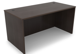
i5 Industries Kai Rectangular Desk Shell – Espresso – D3048, D3060, D3066, D3071, D3671