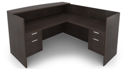
i5 Industries Kai Reception L-Shaped Desk Double Suspended Pedestals – Espresso – RD7172P-1