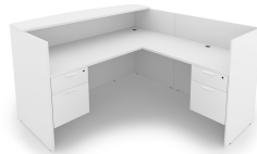
i5 Industries Kai Reception L-Shaped Desk Double Suspended Pedestals – Matte White – RD7172P-1