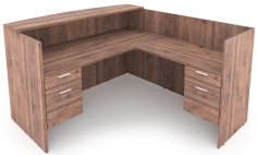
i5 Industries Kai Reception L-Shaped Desk Double Suspended Pedestals – Walnut – RD7172P-1