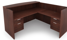
i5 Industries Kai Reception L-Shaped Desk Double Suspended Pedestals – Mahogany – RD7172P-1