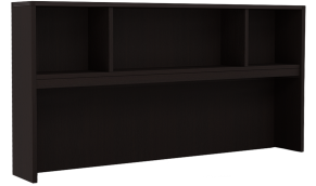
Kai Mahogany Open Hutch Kai Matte White Open Hutch Kai Samoa Gray Hutch Open Hutch