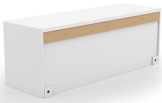
Kai Line 48 Wall Mounted Hutch Matte White Back