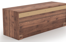
Kai Line 48 Wall Mounted Hutch Walnut Back