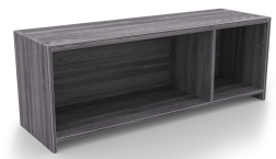
Kai Line 48 Wall Mounted Open Hutch Samoa Gray Side