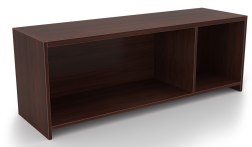
Kai Line 48 Wall Mounted Open Hutch Mahogany Side