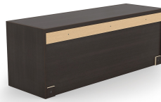
Kai Line 48 Wall Mounted Hutch Espresso Back