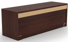
Kai Line 48 Wall Mounted Hutch Mahogany Back