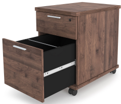
Kai Line Mobile Pedestal Walnut Open