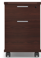
Kai Line Mobile Pedestal Mahogany Front