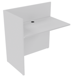
Reception Return Shell – Matte White