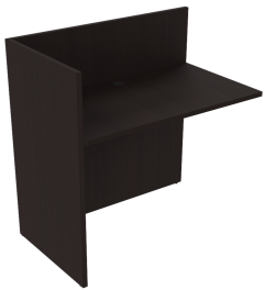
Reception Return Shell – Espresso