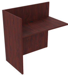
Reception Return Shell – Mahogany