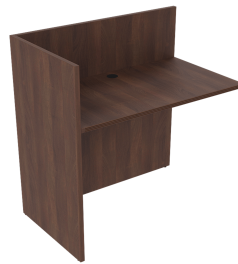
Reception Return Shell – Walnut