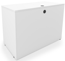
i5 Industries Kai Non-Handed Return Back – Matte White – R2040, R2442, R2448