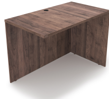
i5 Industries Kai Non-Handed Return – Walnut – R2040, R2442, R2448