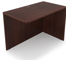
i5 Industries Kai Non-Handed Return – Mahogany – R2040, R2442, R2448