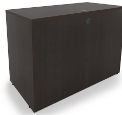
Kai Line Return Shell Espresso Back