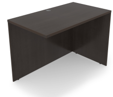
i5 Industries Kai Non-Handed Return – Espresso – R2040, R2442, R2448