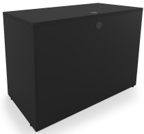
i5 Industries Kai Non-Handed Return Back – Black – R2040, R2442, R2448