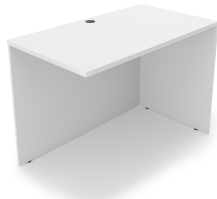
i5 Industries Kai Non-Handed Return – Matte White – R2040, R2442, R2448