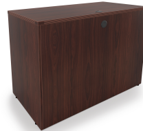
i5 Industries Kai Non-Handed Return Back – Mahogany – R2040, R2442, R2448