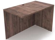
i5 Industries Kai Non-Handed Return – Walnut – R2040, R2442, R2448