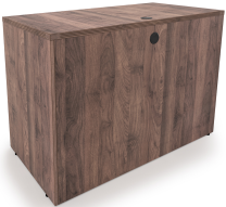
i5 Industries Kai Non-Handed Return Back – Walnut – R2040, R2442, R2448