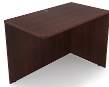
i5 Industries Kai Non-Handed Return – Mahogany – R2040, R2442, R2448