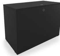
i5 Industries Kai Non-Handed Return Back – Black – R2040, R2442, R2448