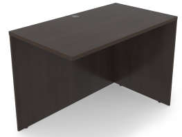
Kai Line Return Shell Espresso Side