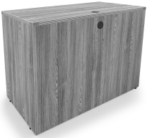
i5 Industries Kai Non-Handed Return Back – Samoa Gray – R2040, R2442, R2448