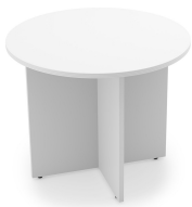
Kai 36 Round Table Matte White