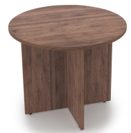
Kai 36 Round Table Walnut