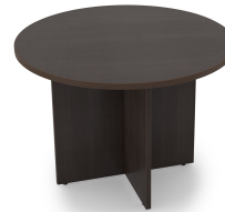
Kai 42 Round Table Espresso