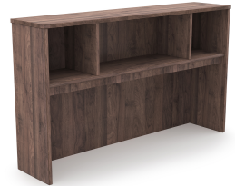
i5 Industries Kai Open Hutch – Walnut – OH66, OH71