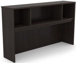
i5 Industries Kai Open Hutch – Espresso – OH66, OH71