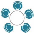
Table Size: 42" Seats: 4-5 people Room Needed: 11'x11'