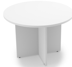
i5 Industries Kai Round Conference Table – Matte White – RT42