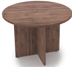
i5 Industries Kai Round Conference Table – Walnut – RT42