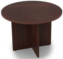
i5 Industries Kai Round Conference Table – Mahogany – RT42