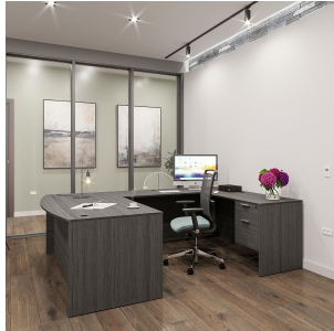
U Shaped Bow Front Desk with Suspended Pedestal – Samoa Gray