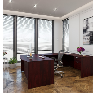
U Shaped Bow Front Desk with Suspended Pedestal – Mahogany