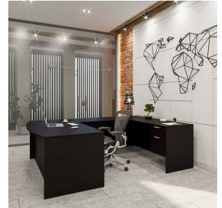
U Shaped Bow Front Desk with Suspended Pedestal – Espresso