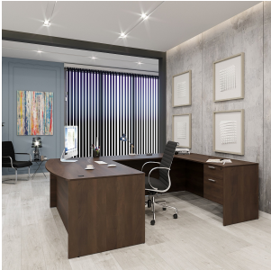
U Shaped Bow Front Desk with Suspended Pedestal – Walnut