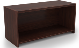
i5 Industries Kai Wall Mounted Hutch – Mahogany – WH36