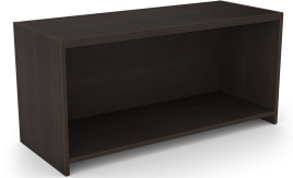
i5 Industries Kai Wall Mounted Hutch – Espresso – WH36