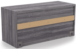
i5 Industries Kai Wall Mounted Hutch Back View – Samoa Gray – WH36