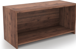
i5 Industries Kai Wall Mounted Hutch – Walnut – WH36