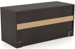
i5 Industries Kai Wall Mounted Hutch Back View – Espresso – WH36