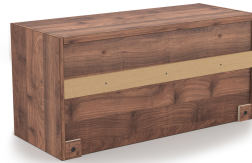
i5 Industries Kai Wall Mounted Hutch Back View – Walnut – WH36