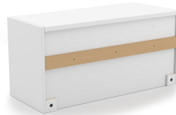
i5 Industries Kai Wall Mounted Hutch Back View – Matte White – WH36