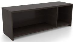
i5 Industries Kai Wall Mounted Hutch – Espresso – WH48