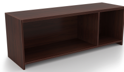
i5 Industries Kai Wall Mounted Hutch – Mahogany – WH48