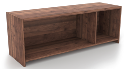
i5 Industries Kai Wall Mounted Hutch – Walnut – WH48