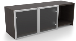
i5 Industries Kai Wall Mounted Hutch with 2 Glass Doors – Espresso – WH48P-G2