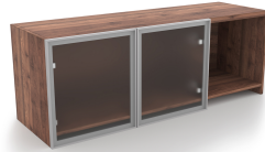
i5 Industries Kai Wall Mounted Hutch with 2 Glass Doors – Walnut – WH48P-G2