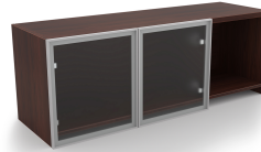
i5 Industries Kai Wall Mounted Hutch with 2 Glass Doors – Mahogany – WH48P-G2