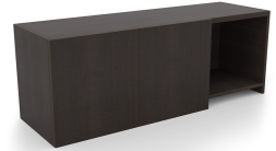
i5 Industries Kai Wall Mounted Hutch with 2 Wood Doors – Espresso – WH48P-L2