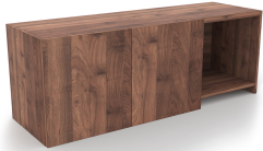
i5 Industries Kai Wall Mounted Hutch with 2 Wood Doors – Walnut – WH48P-L2