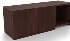
i5 Industries Kai Wall Mounted Hutch with 2 Wood Doors – Mahogany – WH48P-L2