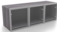
i5 Industries Kai Wall Mounted Hutch with 3 Glass Doors - Samoa Gray – WH48P-G3