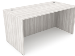
i5 Industries Rayne Rectangular Desk Shell – Harbor Elm – RN-D3048, RN-D3060, RN-D3066, RN-D3071, RN-D3671