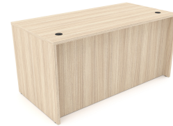
i5 Industries Rayne Rectangular Desk Shell – Coastal Dune – Front – RN-D3048, RN-D3060, RN-D3066, RN-D3071, RN-D3671