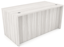
i5 Industries Rayne Rectangular Desk Shell – Harbor Elm – Front – RN-D3048, RN-D3060, RN-D3066, RN-D3071, RN-D3671