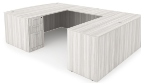
i5 Industries Rayne U-Shaped Bow Front Desk Full Ped Lateral File Back – Harbor Elm – RN-UBD71102P-3, RN-UBD71108P-3