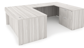
i5 Industries Rayne U-Shaped Bow Front Desk Full Ped Lateral File – Harbor Elm – RN-UBD71102P-3, RN-UBD71108P-3