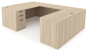
i5 Industries Rayne U-Shaped Bow Front Desk Full Ped Lateral File Back – Coastal Dune – RN-UBD71102P-3, RN-UBD71108P-3